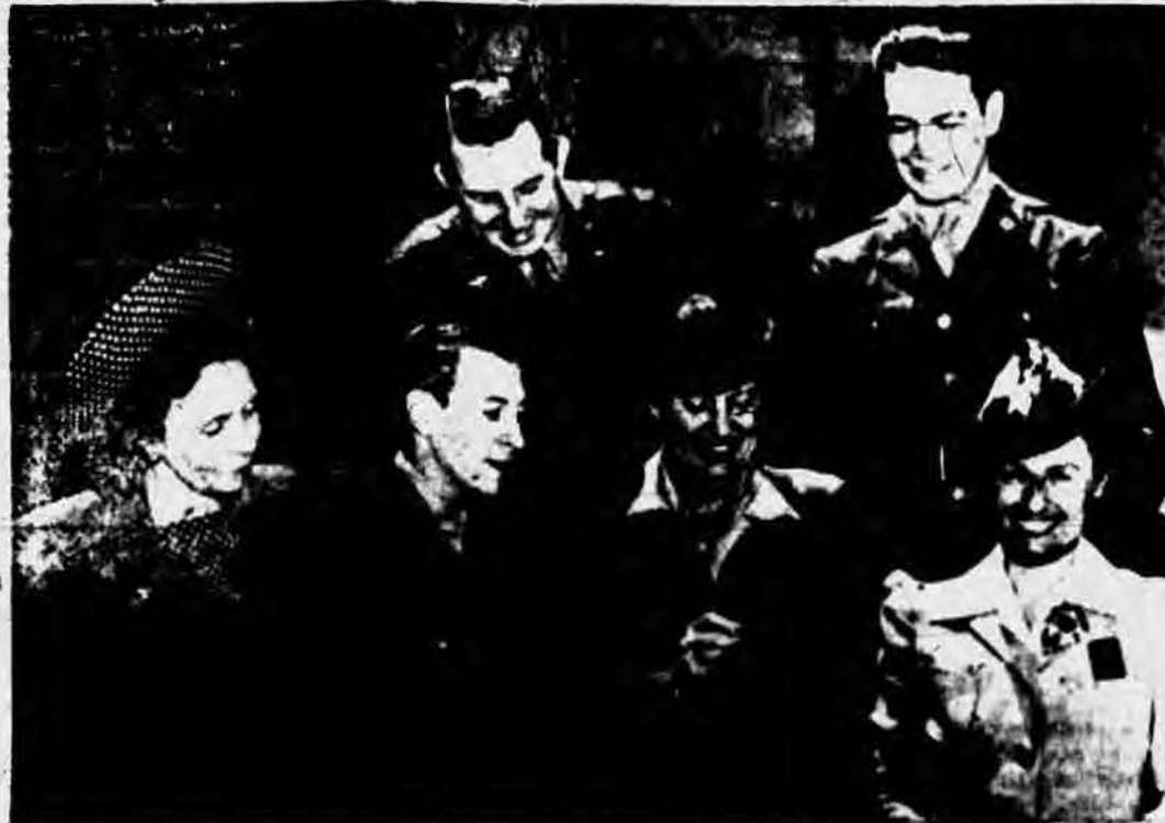
With a plan to provide a large scale recreational program for Cadets at the U. S. Air Corps Replacement Training Center, a committee from the Orange County Assistance League yesterday visited the post.