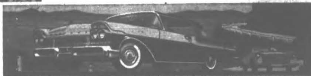
WIDEST RANGE AND CHOICE OF POWER IN MERCURY HISTORY... A 290-hp TURBOCHARGER V-8 engine is optional on all models. In the Monterey series the standard engine is a 255-hp Safety-Surge V-8 with a Power-Booster Fan that saves horsepower other cars waste. A 255-hp Safety-Surge V-8 is standard in the Monterey series. A special M-335 engine (335-hp) is available at extra cost in Monterey models equipped with standard transmissions.