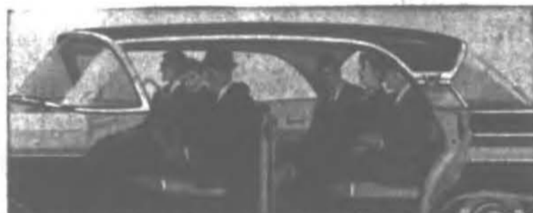
FAR BIGGER IN EVERY IMPORTANT DIMENSION... This year Mercury has grown bigger in every important dimension. For example, there is more headroom, leg room, shoulder room, hip room.