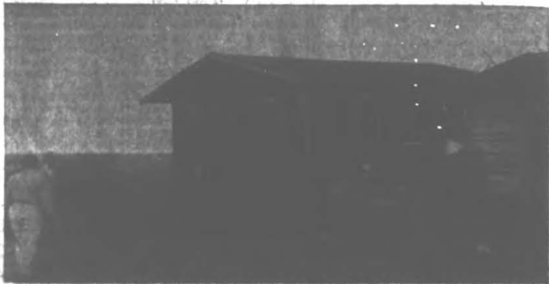
WESTERN TOWN NUCLEUS — Preparatory to creating a 'rootin', 'tootin', shootin' western street, complete with false fronts for movie and TV purposes, workmen move some shabby old dwellings into position on the Buffalo Ranch.