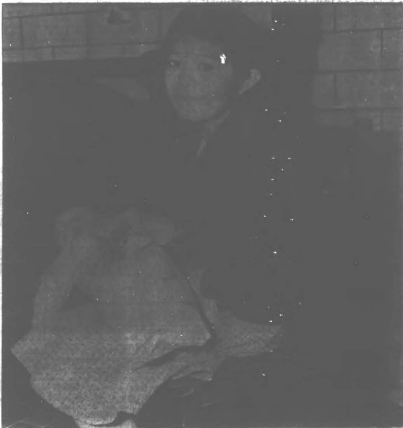
INDIAN GIRL WITH DOLL — Actually no Harbor area implications in this portrait, except