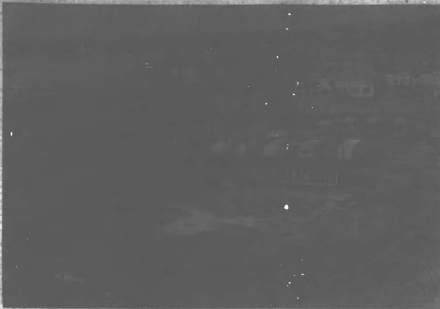
HUGE TRANSACTION — Indicative of type of business deals Newport Beach can expect during 1957 was sale of Port Orange by J. S. Barrett to